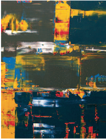
Feb. 16, 2008, oil on birch panel, 30" x 40."