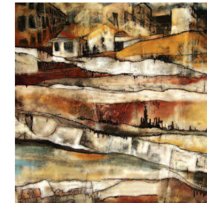
Memory, mixed media, 60" x 55."

"My work focuses on endangered botanical forms. While I have a strong formal interest in plant structures, conceptually my work looks at problems facing our botanical ecosystems, and attempts to raise public awareness through education and increased exposure."