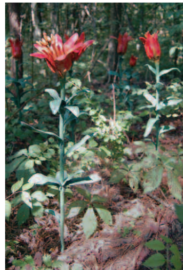
Lilium Philadelphicum, Fired ceramic stoneware with under glazes, acrylic paints, and several different epoxies and sealers.

"Most recently, my work has been influenced by globalization of communities and therefore art forms that represent them. Most ideas for my pieces come from my work and travels abroad and within the U.S., including visits to artist communities in remote locations throughout the world. My most recent trips have been to Thailand and Bhutan in July 2009."