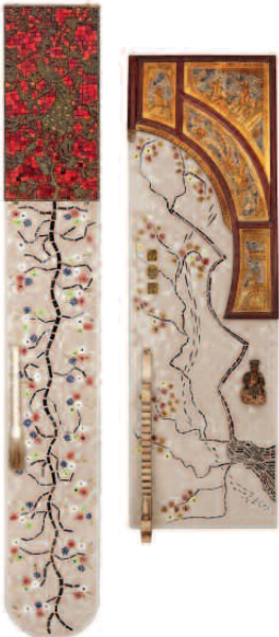
Left: Golden Peacock, 24k gold leaf, Murano smalti, tile, found objects on wood, 12" x 75" x 5." Right: War and Pisces, Murano smalti, tile, found objects on wood, 23" x 73" x 12."

On exhibit are letterpress prints, hand-made books and various mixed media projects by APSU faculty, students and visiting artists.