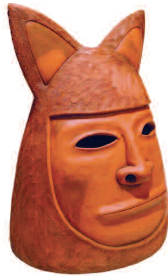
Colossal Cat Head, terra cotta, 22" x 34" x 20."

"In this abstract body of work, the material qualities of paint are exploited to create a surface built up from movement over time. As paint is pushed across a hard support, marks, colors, lines, and light intrinsically emerge. Each painting's title comes from the date on which it is completed, thus producing a meditative gesture towards the anonymous day."